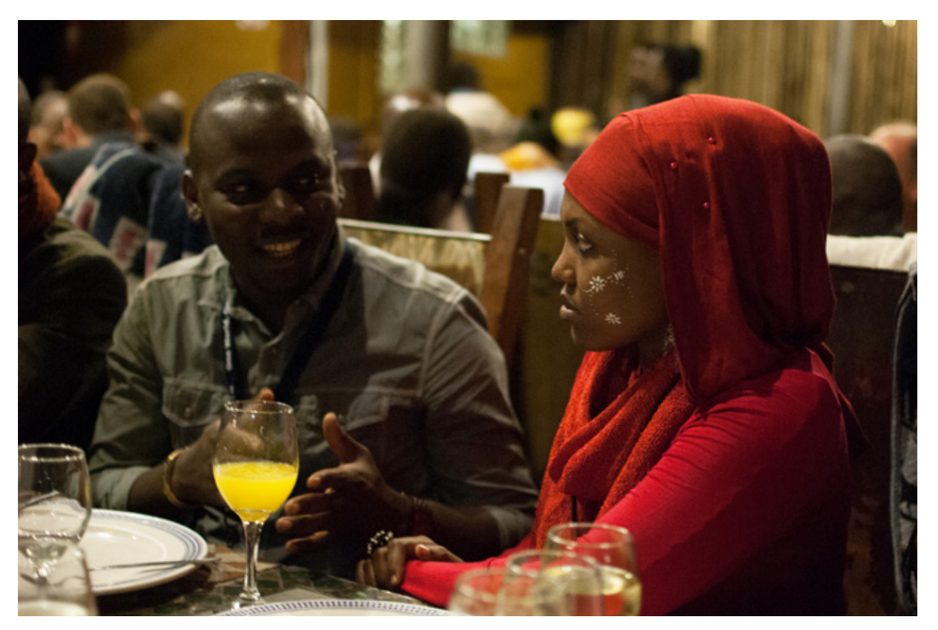
Africa DNS Forum 2013